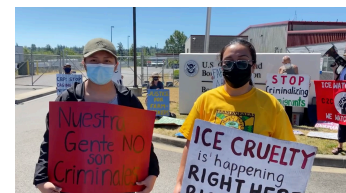
June 25, 2021— vigil outside of Ferndale Border Patrol facility

2021, June 3 Farmworkers are Detained in Lynden C2C calls on supporters to contact Sumas, Blaine, and Ferndale Border Patrol stations to ask where the community members are being held and demand their release. Officials from these facilities routinely lie and attempt to redirect callers to national complaint lines, in order to dissolve the people power involved in the direct action. C2C organizes protests and vigils in front of the Ferndale BP station.